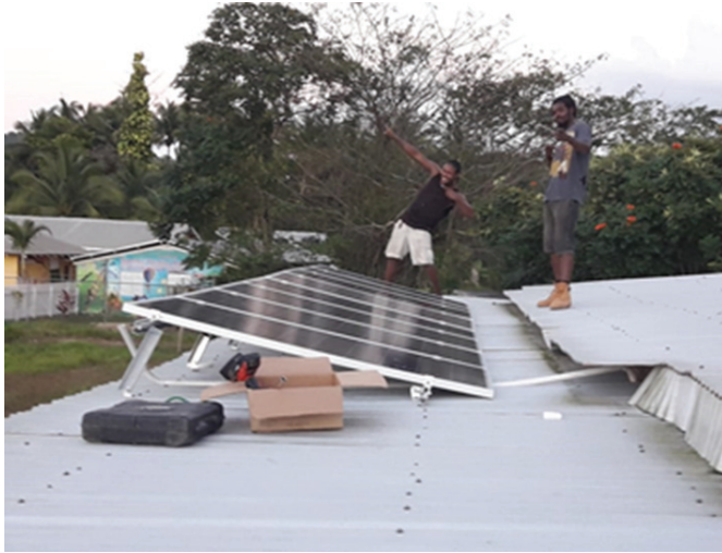
Installation of solar panels in progress atop the LFMC's office

To date 8 solar panels have been installed at the office of the LFMC and office equipment has been purchased and in use. A survey is being undertaken of the areas to be reforested in the forest reserve. Farmers and community members have been engaged in land preparation activities and 2 hectares of land have been prepared for planting. Three (3) community meetings have been held to educate persons on the importance of reforestation.