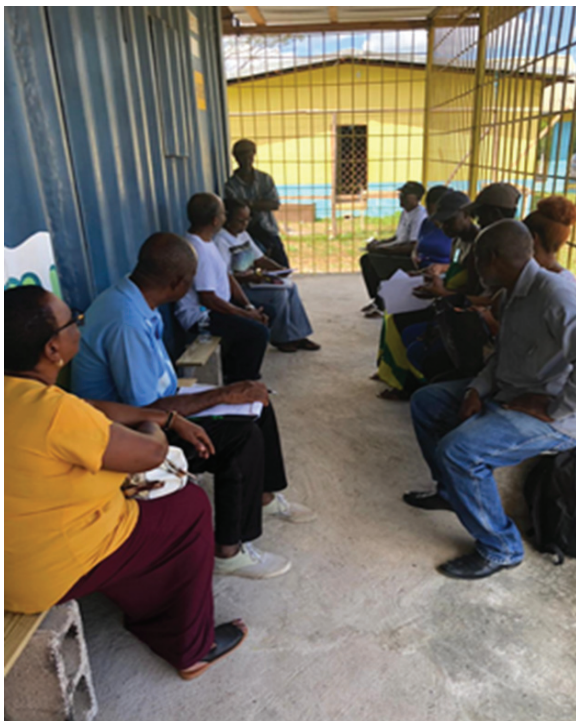
LFMC members meeting at the Duanvale location