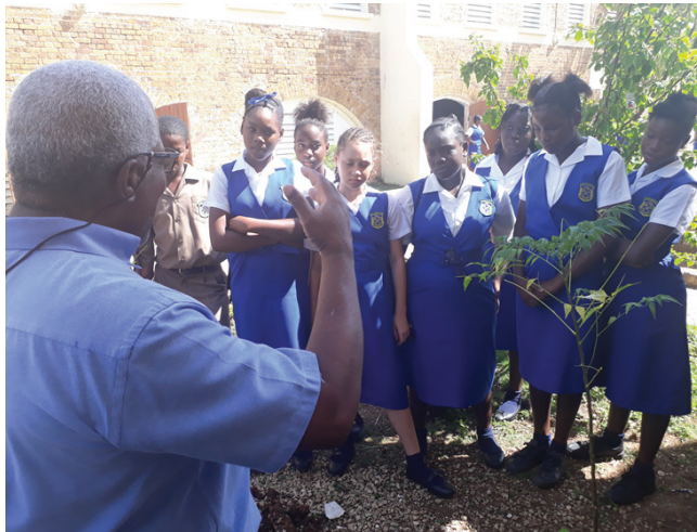
Tree planting at a participating school