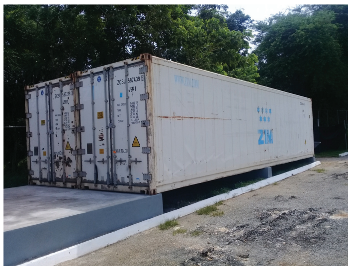
Two reefer cold storage containers installed through SCCAF funding