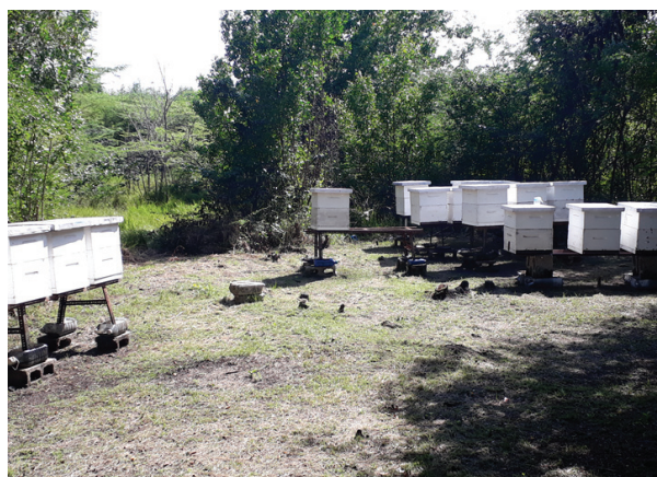
One apiary set up through the grant

28 persons and 31 households have been directly impacted.