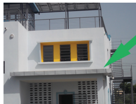
Gutters (indicated by the arrow) installed for water harvesting