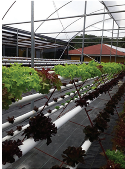
A 2,400 sq. ft. hydroponics greenhouse with 11 varieties of baby mix lettuce