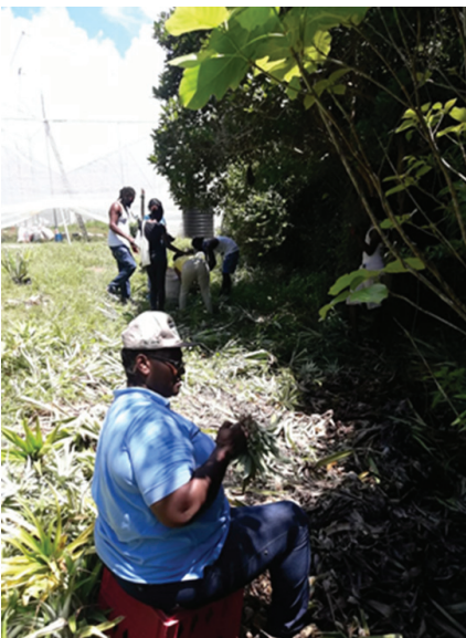
Community members at work planting pineapple barriers

To date twelve (12) farmers have been supplied with fruit seedlings and 3 hectares have been planted in the forest. Thus far 100 farmers have been trained in agro smart technology, disease control and greenhouse technology. Four (4) community meetings were held and environmental education and awareness sessions were held with schools in Hanover along with tree planting activities hosted by the Forestry Department.