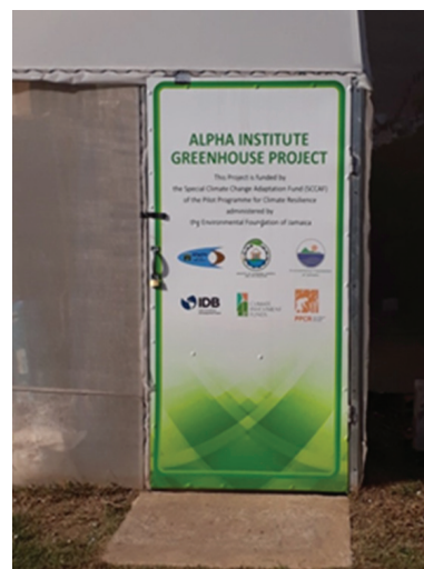
Project sign affixed to the door of greenhouse