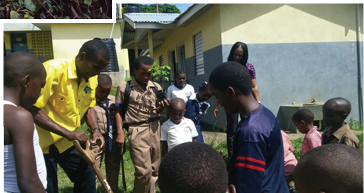
School programme with Forestry Department tree planting activities at a participating school