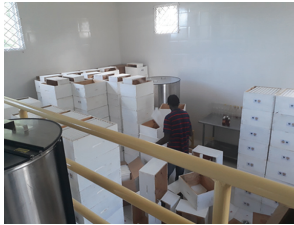
Beekeeping equipment in the honey processing unit.