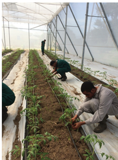
Training session with students at Alpha

PROJECT TITLE: Faith Academy Hydroponics Greenhouse