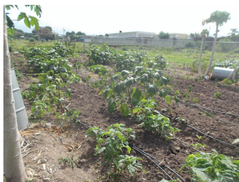
Vegetable plot after first harvest