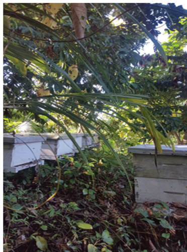
Hive boxes distributed to participating farmers