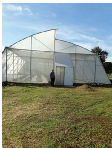
Completed 3,000 sq. ft. greenhouse