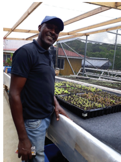
Project Manager in greenhouse with lettuce seedlings