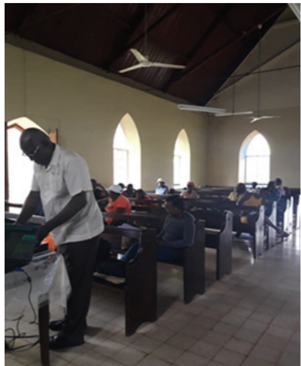
Training session in progress