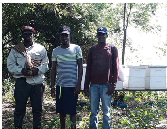
Three (3) persons who benefitted from the beekeeping training and start up hives.

Implementing Organisation: Cockpit Country Local Forest Management Committee (CCLFMC)