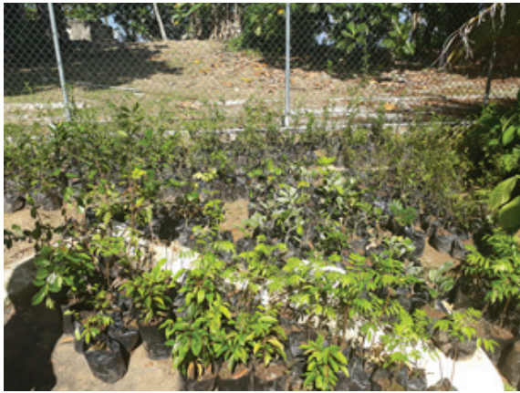
Seedlings distributed to farmers