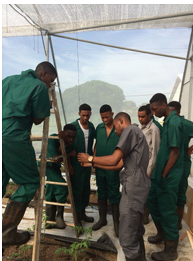
Students planting tomato seedlings in the greenhouse