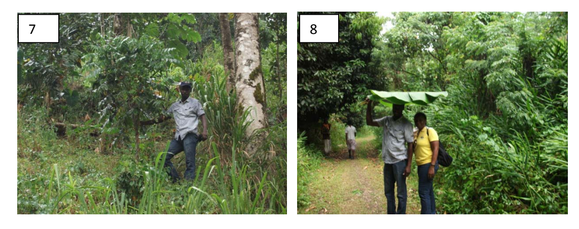
Picture 7: A seedling on a reforestation site which Bowden Pen farmers planted.

Achievements: Corn Puss Gap trail has been restored and retrofitted with bridges and a clear walkway to facilitate guided tours along the path. Also a new trail was created for the Bernard Spring Waterfall and 15 persons were trained in trail guiding. 10 acres of forest around the trails were reforested, although 3 acres were damaged by forest fires, the grantee replanted the seedlings. The cabins at Ambassabeth were constructed and are in full use as accommodation for visitors. For the period January to December 2015 it was reported that 156 locals and 93 foreigners stayed at the cabins and hiked in the Blue and John Crow Mountains.