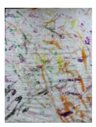
Art work created by Special Needs children from the STEP Centre as part of their Therapy Work

A grant was provided to the Jamaican Association on Intellectual Disabilities ( JAID) to assist students at the Randolph Lopez School of Hope and the Early Stimulation Programme with specialized equipment for children with disabilities. A handover ceremony was held to formally present three students with their new wheel chairs.