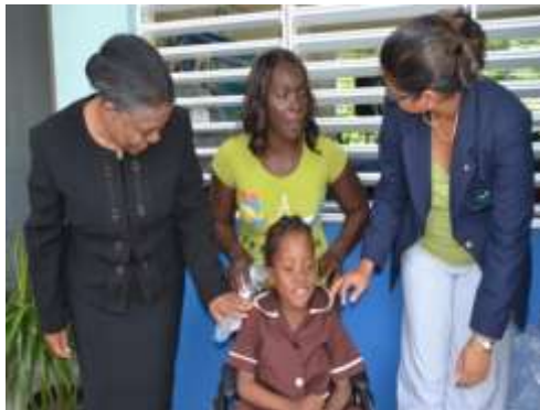
Handing over of wheelchairs at the Jamaica Association for Intellectual Disabilities