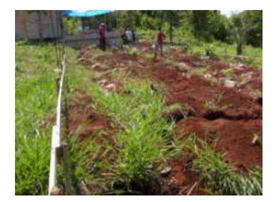
Construction of placement area for water tanks and adjoining abattoir