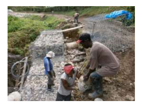
Construction of retaining wall with gabion baskets by the Jeffrey Town Farmers Association in St. Mary, Jamaica