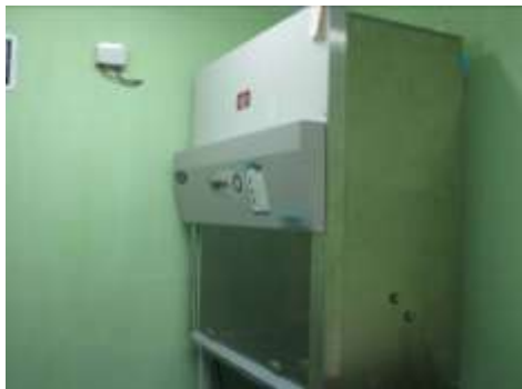
FCF supported Laminar Flow used to create a suitable test environment