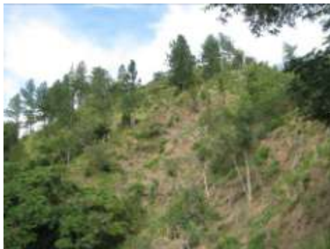
Denuded hillside being reforested under the project