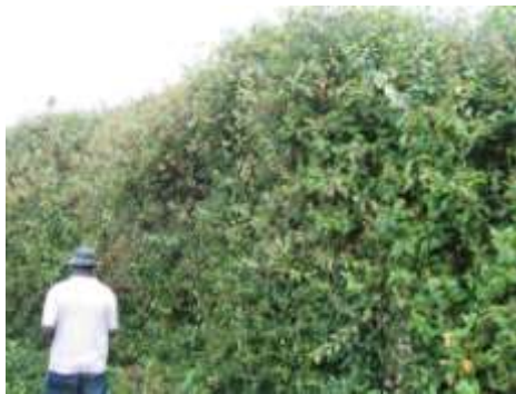
Overgrowth of Red Bush along the roadside leading to the reforestation plots in Cinchona.