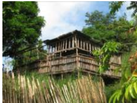
FCF funded goat house