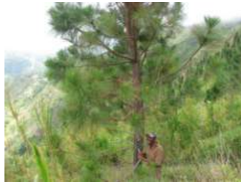
Park Ranger standing beside a 3 year old Caribbean Pine. The tree is over 18 ft tall.