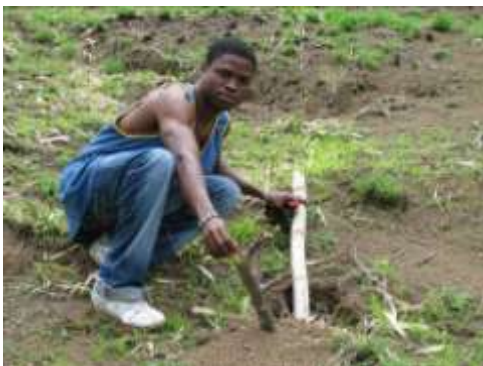
Community member pegging where seedling will be planted