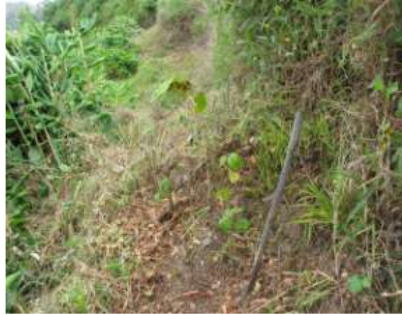
Rows cleared of Wild Ginger on the hillside in Cinchona to plant timber seedlings.