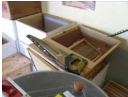
FCF supported beekeeping equipment

Project Title: Reforestation and Sustainable Agriculture for Soil Stabilization in the Blue Mountains