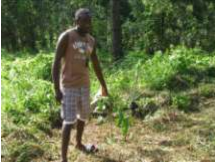
Community member pointing out a seedling