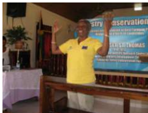
Project manger presenting at the launch of the project