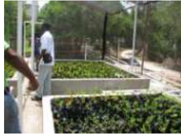
Inside the nursery at DBML