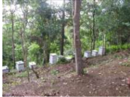
Bee hives established at the project site