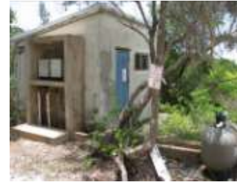
Pumping system at DBML nursery