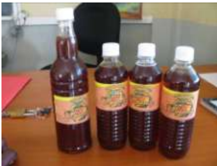
FCF supported honey from Smithfield