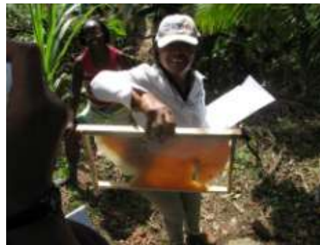
Project Manager showcasing a honey comb