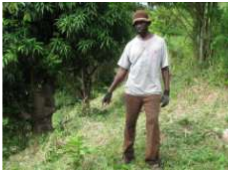
Community member pointing out a seedling at project site

Achievements: To date, 10.5 hectares of land have been reforested. Fifteen (15) individuals have been trained in beekeeping and 10 of the 11 persons trained in goat rearing have constructed their own goat houses.