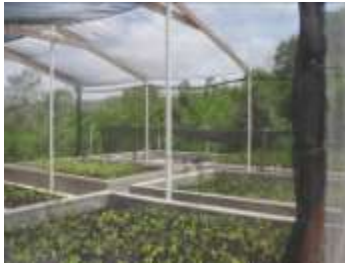
Nursery at DBML at capacity

Achievements: The PRML and DBML nursery targets have been met with the DBML operating at its maximum with 5,000 seedlings. Additionally, the physical and chemical properties of five (5) coastal sites (one more than targeted) have been analyzed for targeted rehabilitation. The FCF and other partners will continue to support and promote this technology.