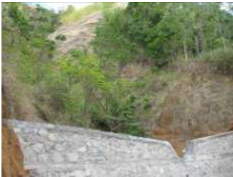
Check dam constructed under the project

The results of this project have been particularly positive for the community of approximately 1,500 hundred people, which now better understands the positive impact of retaining forest protection against landslides and serious damage to life and property within the community.