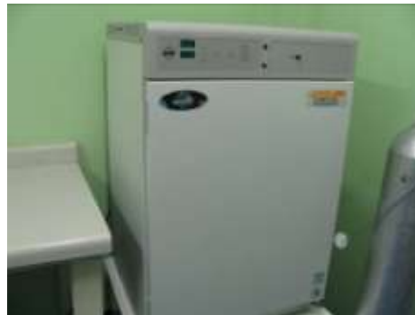
FCF supported Carbon dioxide incubator used in the lab