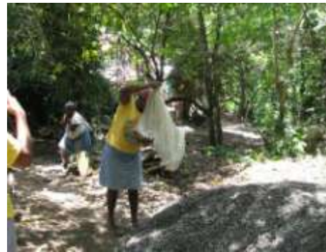
Community members at work during the construction of the dams